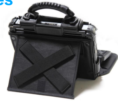
Optional Field Attachment

410010 (Dockable Carry Case) 410000 (Field Case Attachment)