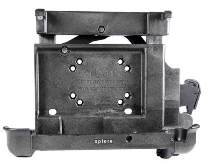
xDock Pro (cradle only)